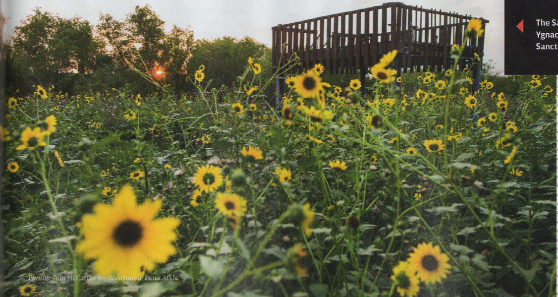
◀ The San Ygnacio Bird Sanctuary.